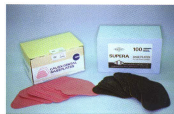
Shellac Bases Ideal thickness and adaptability