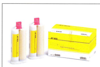
Coltene Jet Bite Accurate occlusal registration