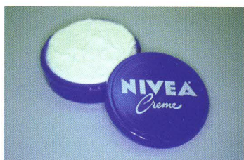
Hand Cream To separate the silicone moulds