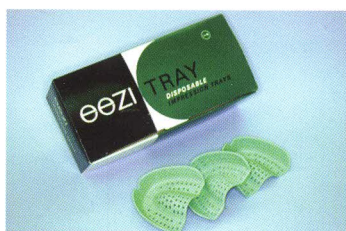
Wrights Eezitray To stabilise the silicone moulds