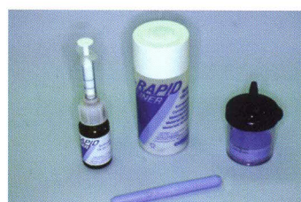
Coltene Rapid Liner Wash impressions