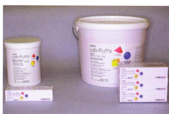
Coltene Lab Putty Stable low cost silicone putty